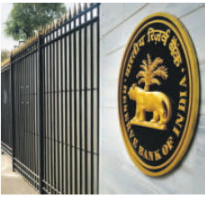
RBI had kept its policy rates unchanged in February citing higher inflationary risks. MINT